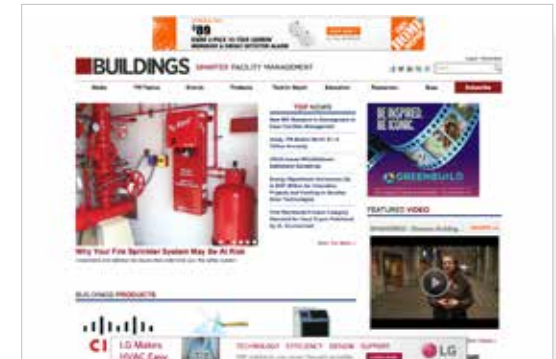
Image sizes: Small: 320 x 50 pixels static Medium: 728 x 90 pixels static Large: 960 x 90 pixels static File Type: PNG Click-through URL for each banner No transparent backgrounds allowed